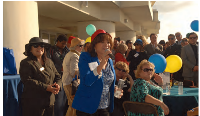
Manuel Cavada / Creative Images