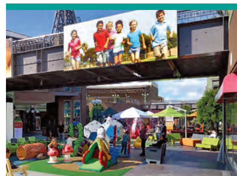
A children's play area was one of the recent improvements made to the Chula Vista Center.

Expansion plans are in the works at the Chula Vista Center, one of the premier shopping destinations in the South County. Following a recommendation by South County EDC members two years ago, the downtown Chula Vista mall underwent an extensive cosmetic renovation in 2012 that included upgrades to its common areas and the addition of an outdoor fireplace with comfortable lounge seating, shaded bistro-style seating areas with landscape borders and colorful umbrellas, and free Wi-Fi throughout the Center. In late October, the center's operator, Rouse Properties, announced it has signed an agreement with AMC Theatres® to open a 35,000-square-foot, state-of-the-art, 10-screen theatre. The new theater is scheduled to open in the summer of 2014.