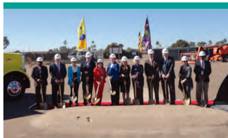
Numerous elected officials and civic leaders attended the groundbreaking ceremony in mid-November for the extension of H Street in Chula Vista.

which has approvals from the California Coastal Commission, envisions more than 500 acres for hotels and convention facilities, homes, shops, restaurants, as well as more than 240 acres of parks and nature preserve. The project is estimated to create more than 7,000 construction and 2,000 permanent jobs.