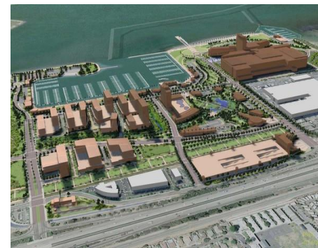
Chula Vista Bayfront