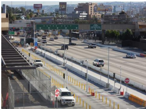
US/Mexico Border Crossings