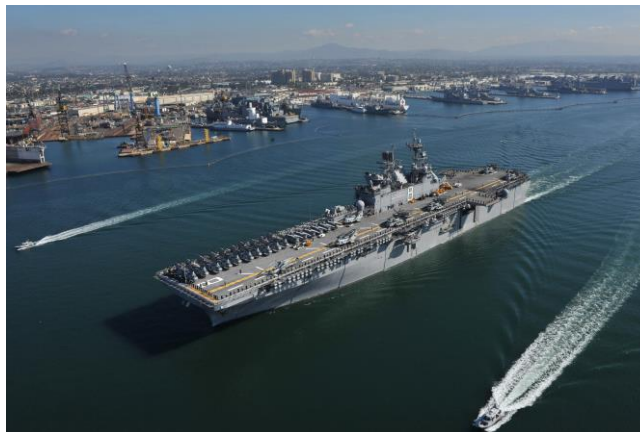
Naval Base San Diego - Shipbuilding